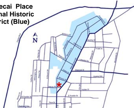
Mordecai Place National Historic District (Blue)

Learn more at: mordecai.org northperson.com seaboardsstationshops.org historicoakwood.org raleighnc.gov/planning rhdc.org